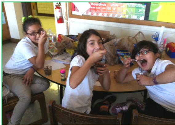
Students enjoy eating their landfills -Yummy!

Approximately 170 youth and volunteers participated in CEP 4-H Youth activities. Take A Stand is an ongoing program offered by Prairie View A&M Cooperative Extension and Texas A&M AgriLife Extension Service targeted to preventing and reducing incidents of bullying. The Cooperative Extension Program/4-H is continually informing youth about the environment. Youth and adult participants learned the process of how landfills are created and operated. Participants made edible landfills out of fruit roll ups, graham crackers, Oreo cookies, pudding, green sprinkles, and twizzlers. These snacks were layered in a matter identical to the layering process of landfills to show how these layers are used as preventative measures to stop trash from landfills reaching our ground waters.